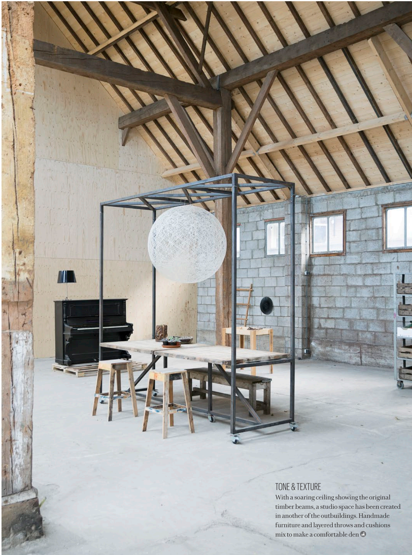
TONE & TEXTURE With a soaring ceiling showing the original timber beams, a studio space has been created in another of the outbuildings. Handmade furniture and layered throws and cushions mix to make a comfortable den 🐾